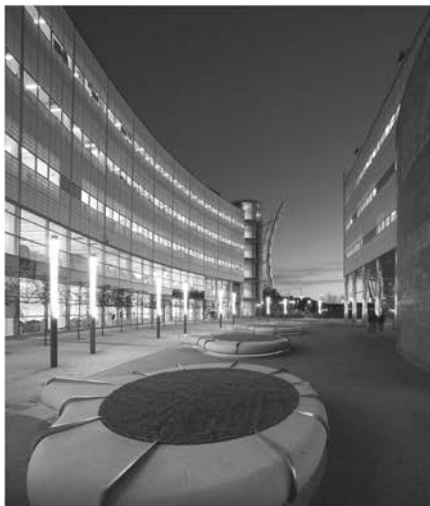
City Campus East

Creative Writing at Northumbria University was awarded two AHRC awards, making Northumbria University a very exciting place to be for a creative writer. The awards will fund on-going research into creative writing methodology and the writer's own reflections on creative writing practice which informs teaching on our range of creative writing programmes.